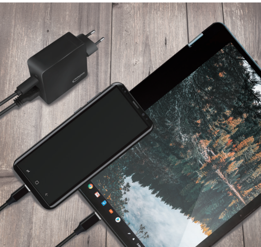
Rapid Charging with PD3.0 and QC3.0

Portable designed for fast charging dual devices simultaneously, perfect for traveling.